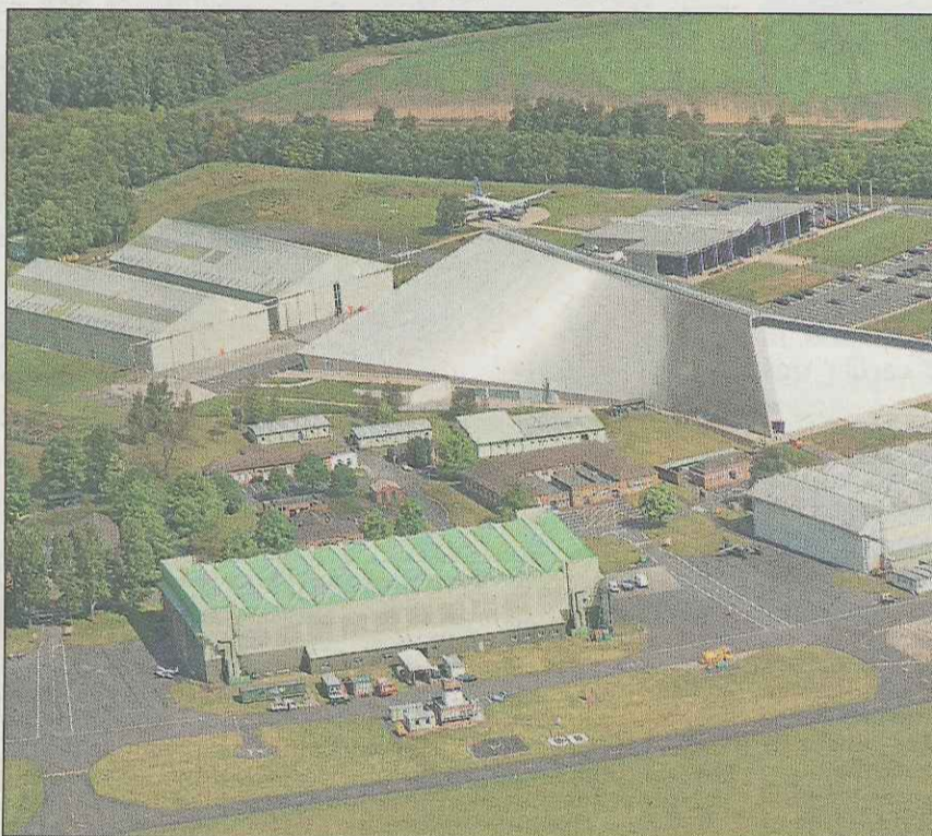
The decision on RAF Cosford has been welcomed by unions