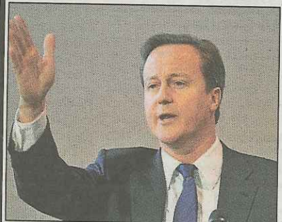
Prime Minister David Cameron